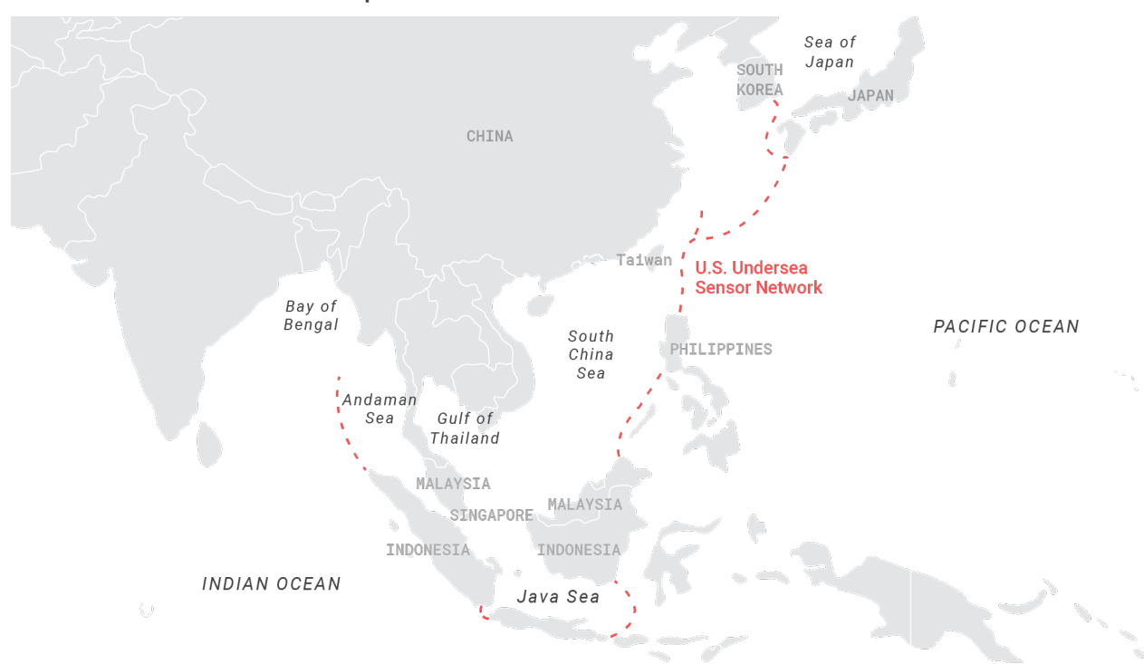
Purported U.S. undersea sensor network

However, the SOFAR can only be tapped in specific geographic areas, such as the edge of a continental shelf or the shelf of an island or archipelago. In the eastern Pacific, the United States can access the SOFAR immediately off its own coast. <sup>133</sup> But it also has entree to the deep sound channel in the western Pacific. There, access to the SOFAR does not lie directly off China's own coast, but rather on the eastern side of the First Island Chain.