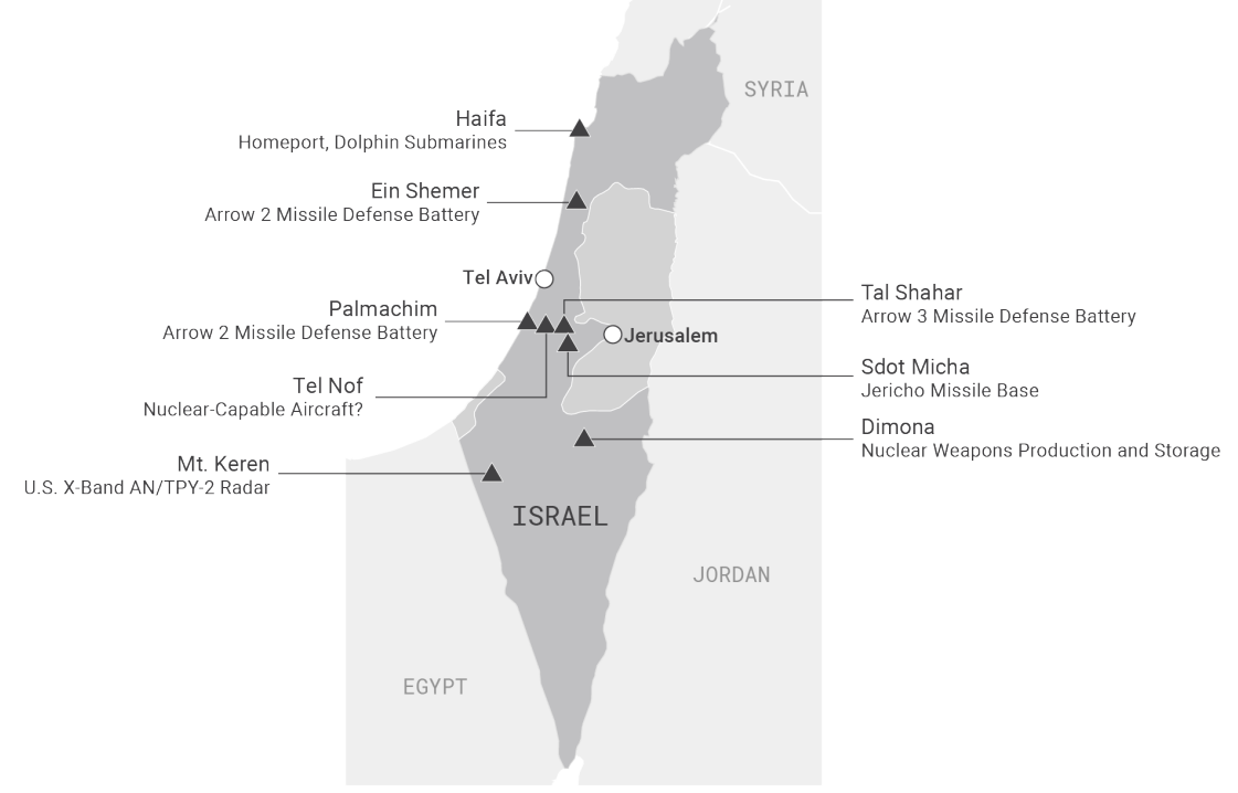
Location of key Israeli strategic facilities

premise for the rumor seems to be a request from the Israeli government in the 1990s to the Clinton administration, asking to buy the nuclear-capable version of the Tomahawk SLCM. The request was denied and there is no firm evidence of Israel developing its own SLCM indigenously.<sup>52</sup>