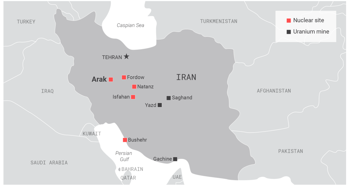
Key Iranian nuclear facilities

But even if a viable fusion design was in hand, Iran would still need the radioactive isotopes, tritium and deuterium, to construct a functioning device.<sup>18</sup> While deuterium is readily available as a derivative of seawater, tritium can only be produced in certain types of nuclear reactors, including heavy water facilities, like Arak in its original configuration.