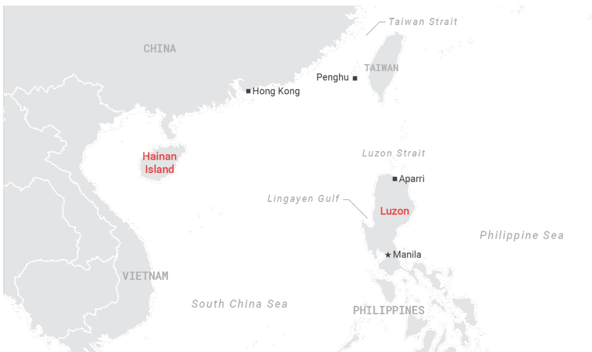
Luzon and its environs

This points to a second important difference: Cruise missiles were in their infancy during World War II, their use confined to terror attacks against civilian targets, as in the case of the German V-1. 11 In the intervening decades, these weapons have substantially increased in range, lethality, and accuracy. They first saw use in naval combat during the 1967 Arab-Israeli War, but it was the Falklands conflict that demonstrated their ability to allow a weaker maritime power to inflict substantial costs